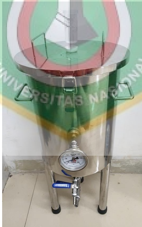
Fermentor anggur kapasitas maksimum produksi 20 liter (2)