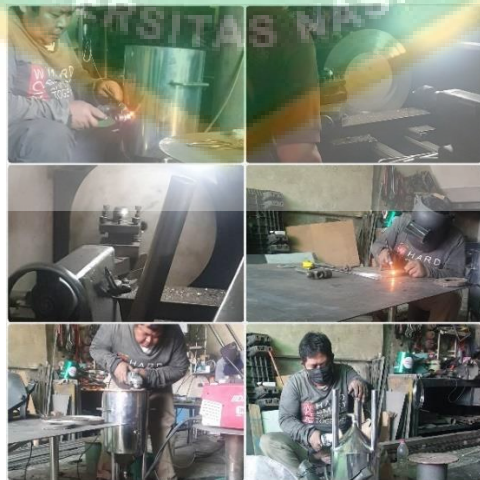
Proses pembuatan fermentor anggur (3)