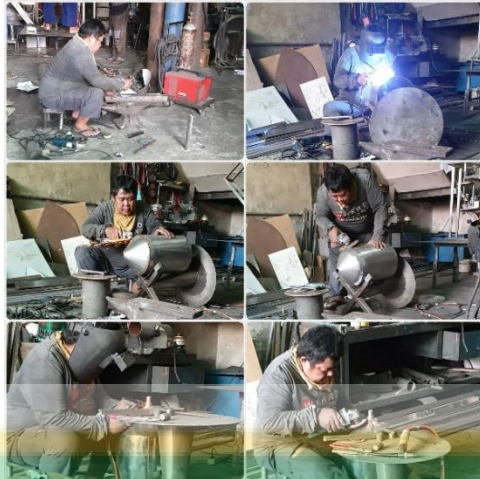
Proses pembuatan fermentor anggur (1)