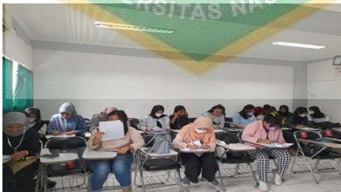
Gambar 2 Dokumentasi pembelajaran